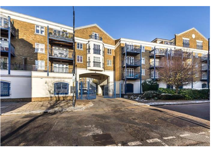
ORIANA HOUSE, VICTORY PLACE, LIMEHOUSE, E14 £1,850 PCM