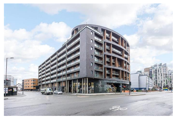
THE SPHERE, CANNING TOWN, E16 £1,650 PCM