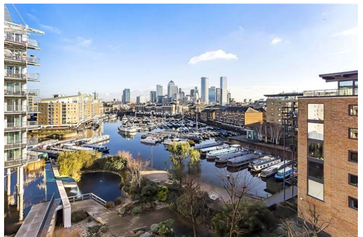
BERGLEN COURT, LIMEHOUSE, E14 £650,000 Leasehold