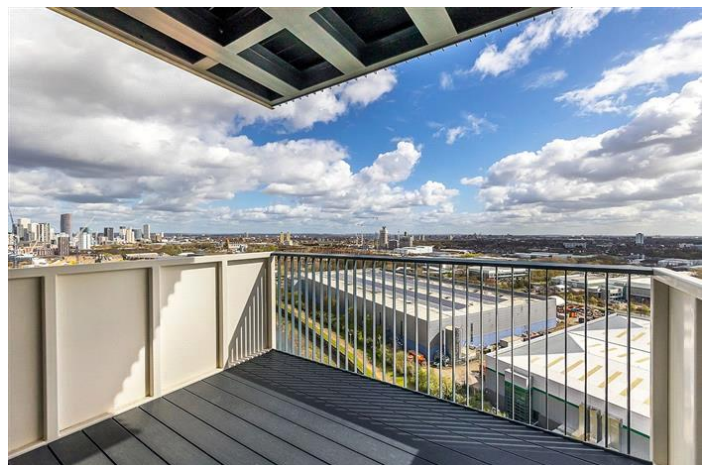
SKYLINE APARTMENTS, BOW, E3 £2,300 PCM