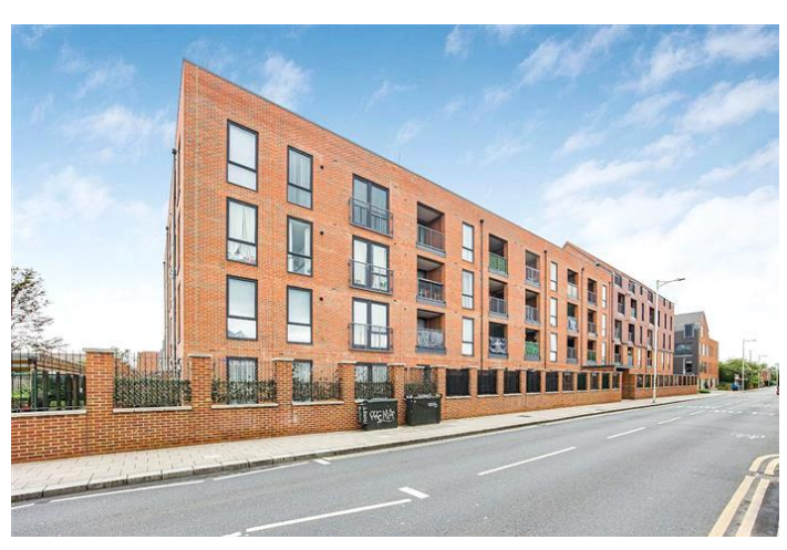
SONAR HOUSE, HAINAULT, IG6 £1,500 PCM