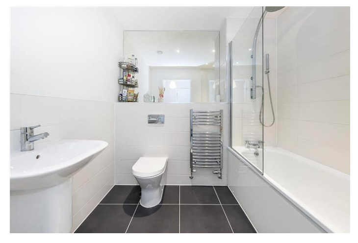
LUCIENNE COURT, POPLAR, E14 £2,500 PCM