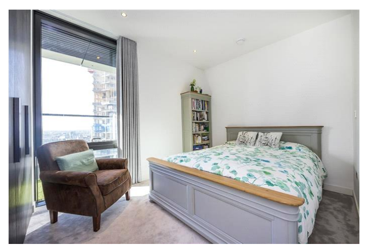
BAGSHAW BUILDING, CANARY WHARF, E14 £4,000 PCM