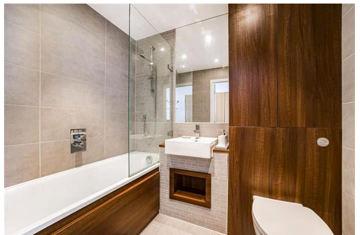
KARA COURT, BOW, E3 £3,000 PCM