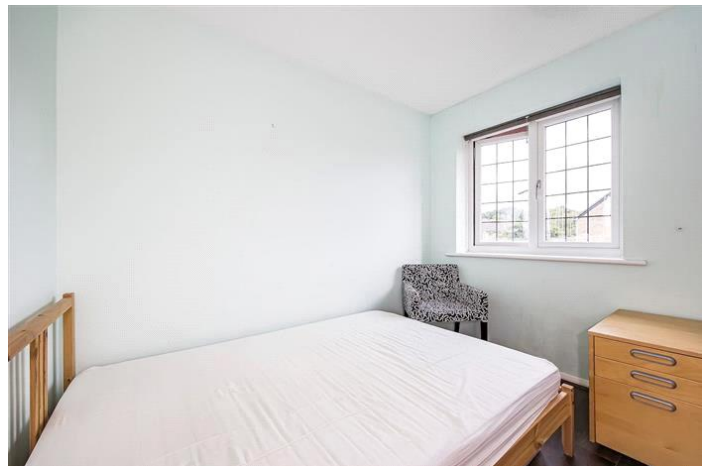
HAZELWOOD PARK CLOSE, CHIGWELL, IG7 £1,600 PCM