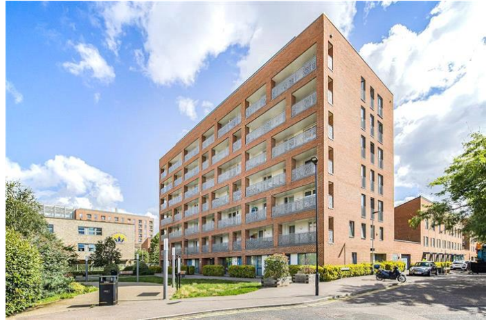
MADDISON COURT, CANNING TOWN, E16 £1,500 PCM