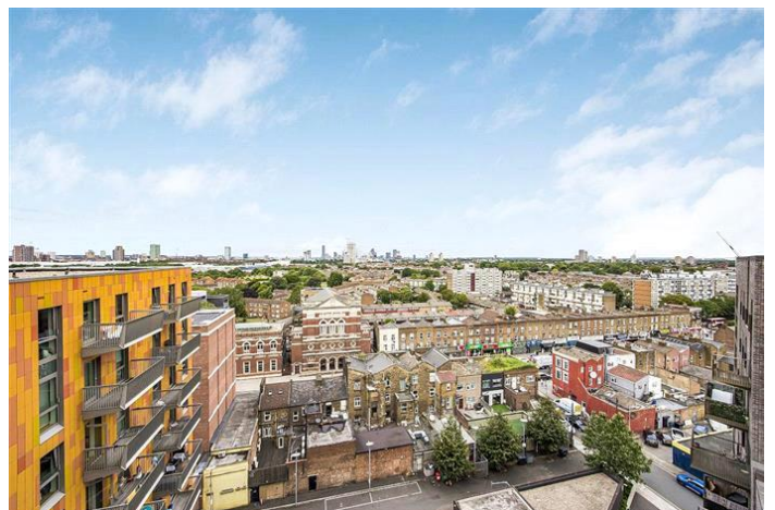
MAUD STREET, CANNING TOWN, E16 £1,800 PCM