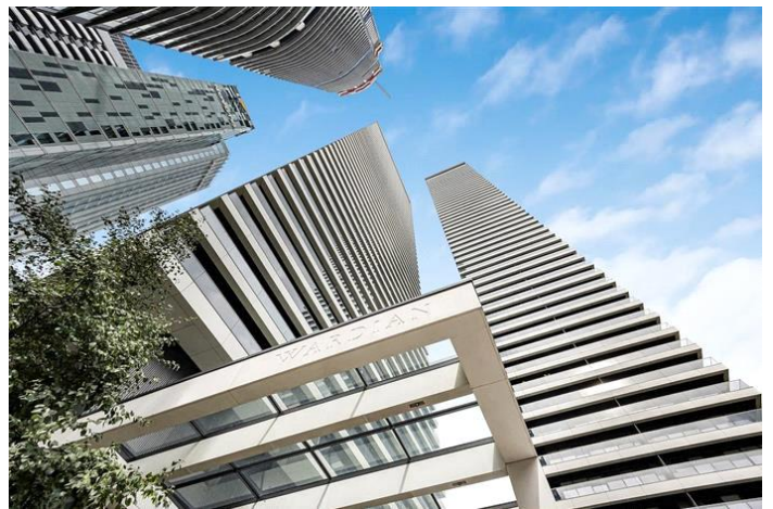
HOBART BUILDING, THE WARDIAN, CANARY WHARF, E14 £2,250 PCM