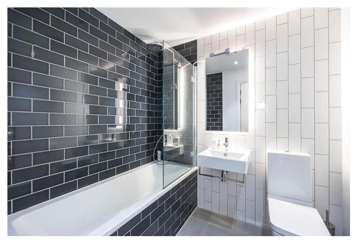
LAKER HOUSE, ROYAL WHARF, E16 £2,500 PCM