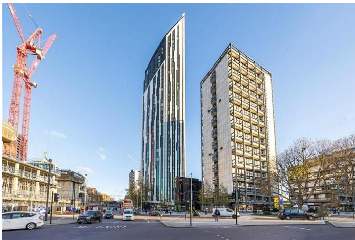
STRATA, ELEPHANT AND CASTLE, SE1 £1,750 PCM