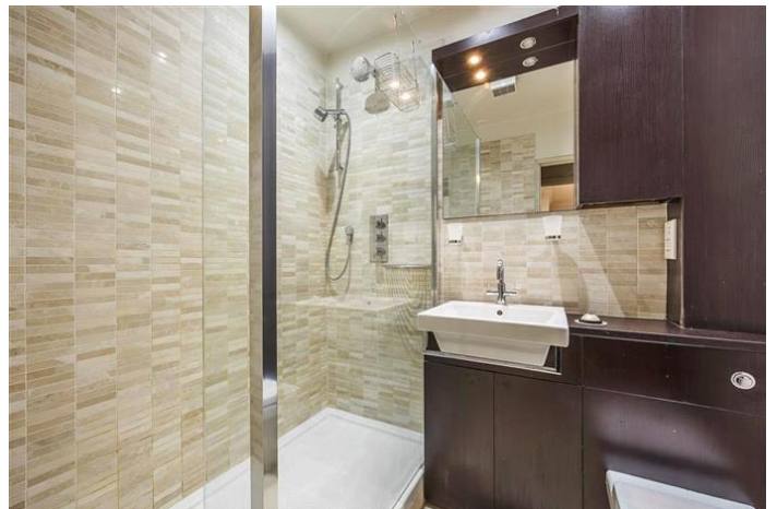
OLD SUN WHARF, LIMEHOUSE, E14 GUIDE PRICE £700,000 Share of Freehold