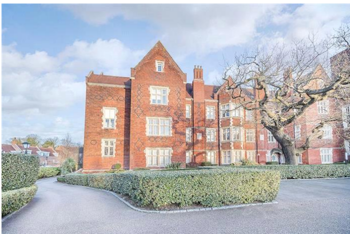
LONDON COURT, BRENTWOOD, CM14 £1,500 PCM