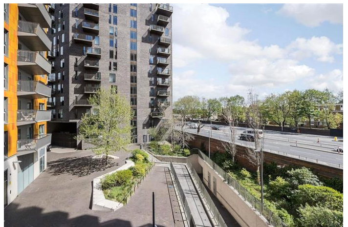
RATHBONE MARKET, CANNING TOWN, E16 £1,750 PCM