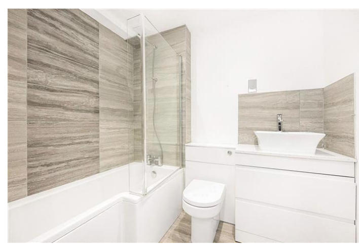
BURDETT ROAD, LIMEHOUSE, E14 £1,900 PCM