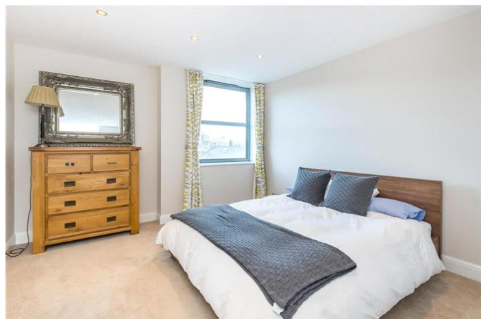
CHINNOCKS WHARF, NARROW STREET, LIMEHOUSE, E14 £3,500 PCM