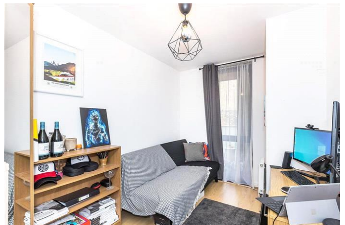
SHEPHERD COURT, POPLAR, E14 £1,925 PCM