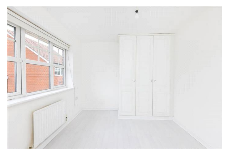
STALHAM WAY, BARKINGSIDE, IG6 £2,600 PCM