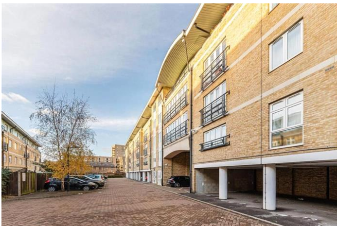
LOCKSONS CLOSE, POPLAR, E14 £1,650 PCM