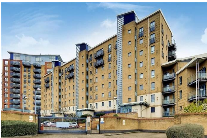
WESTERN BEACH APARTMENTS, ROYAL VICTORIA, E16 £2,200 PCM