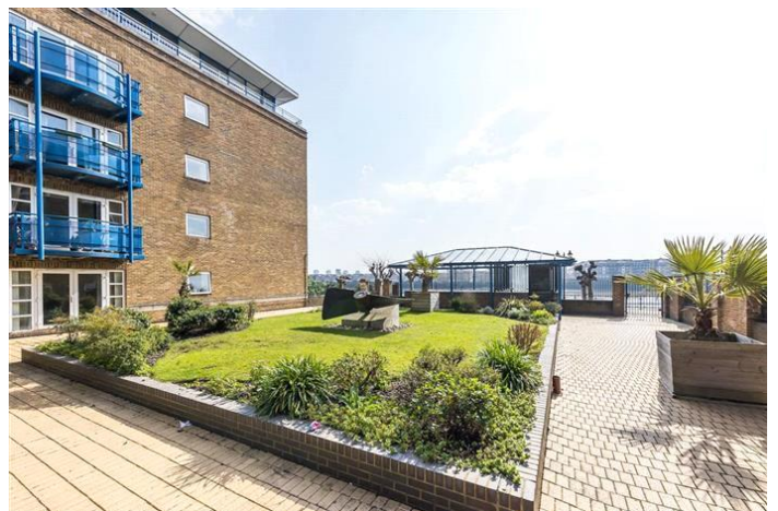
SCOTIA BUILDING, WAPPING, E1W £1,775 PCM