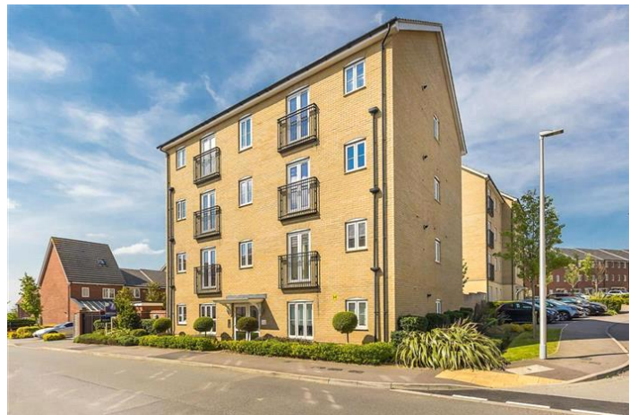
OAK HOUSE, OAKLANDS HAMLETS, CHIGWELL, IG7 £1,300 PCM