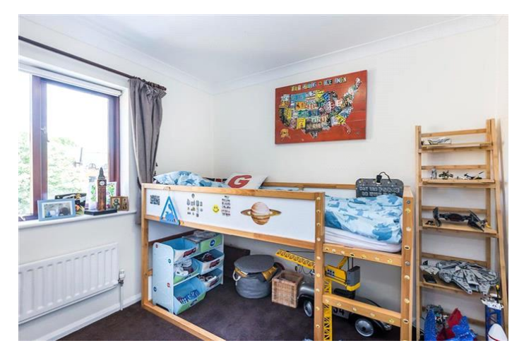
FOWEY CLOSE, WAPPING, E1W £2,500 PCM