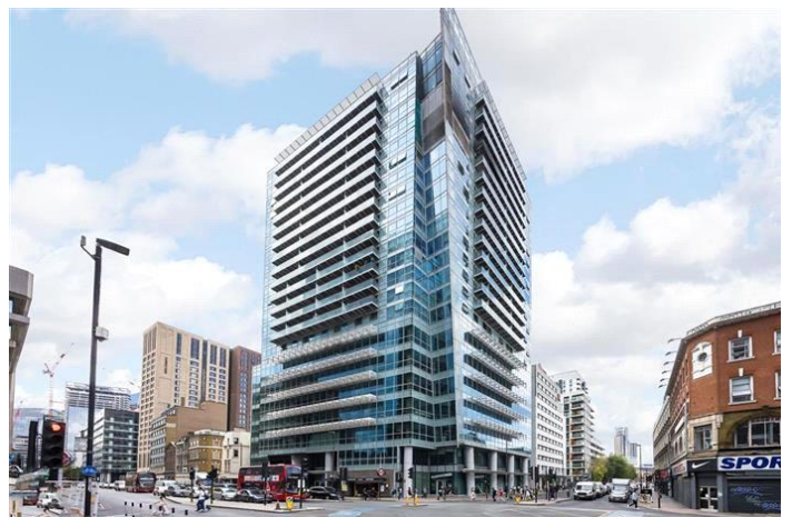
CRAWFORD BUILDING, ALDGATE, E1 £2,100 PCM