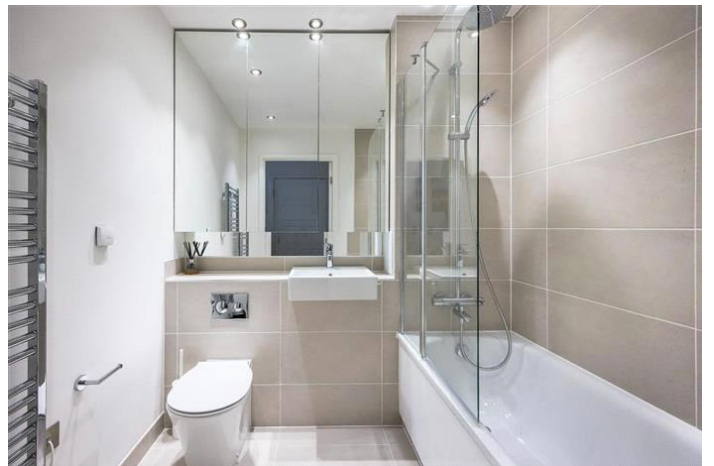
HAMME BUILDING, GALLEONS REACH, E16 £2,000 PCM