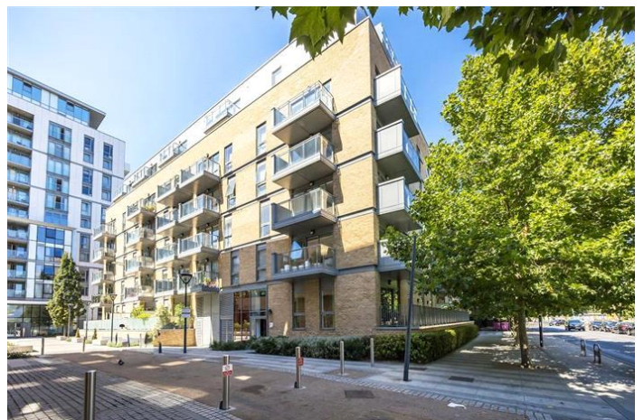
FELIX POINT, POPLAR, E14 £2,700 PCM