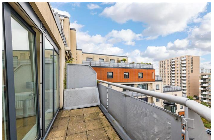
WARDS WHARF APPROACH, LONDON £300,000 Leasehold