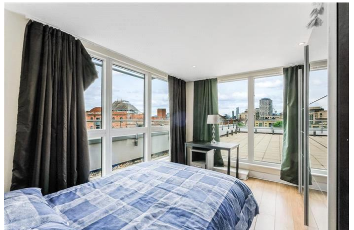
CASPIAN WHARF, BOW, E3 £2,250 PCM