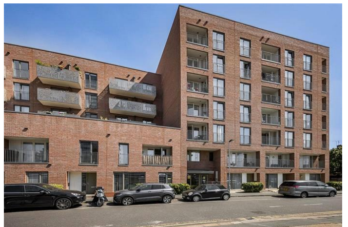
KATIE COURT, CANNING TOWN, E16 £1,600 PCM