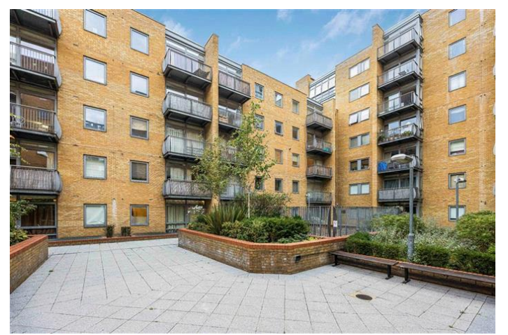
LOWRY HOUSE, CANARY WHARF, E14 £1,850 PCM