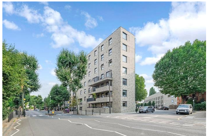
TRIANGLE APARTMENTS, ISLE OF DOGS, E14 £2,150 PCM