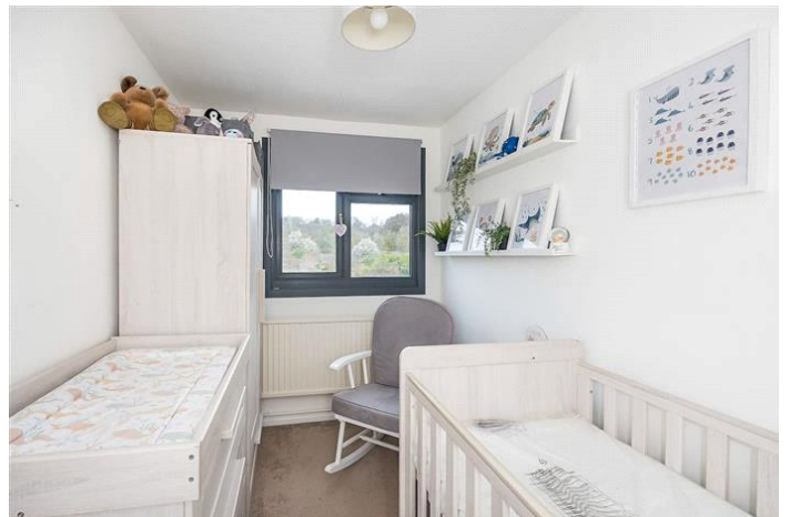
BYRON AVENUE, BOREHAMWOOD, WD6 £500,000 Freehold