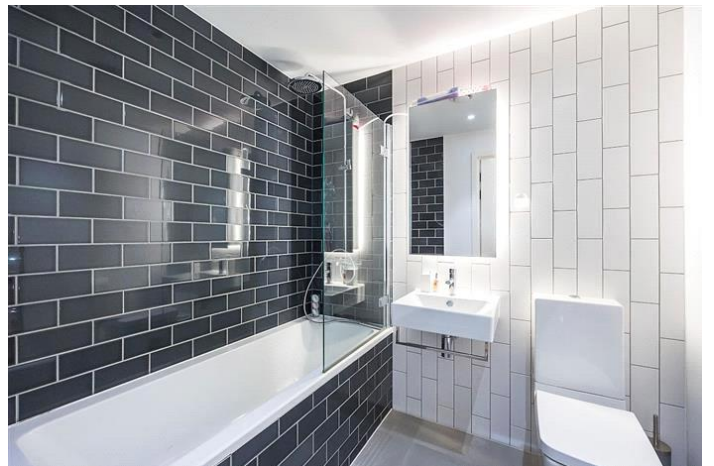
LAKER HOUSE, ROYAL WHARF, E16 £630,000 Leasehold