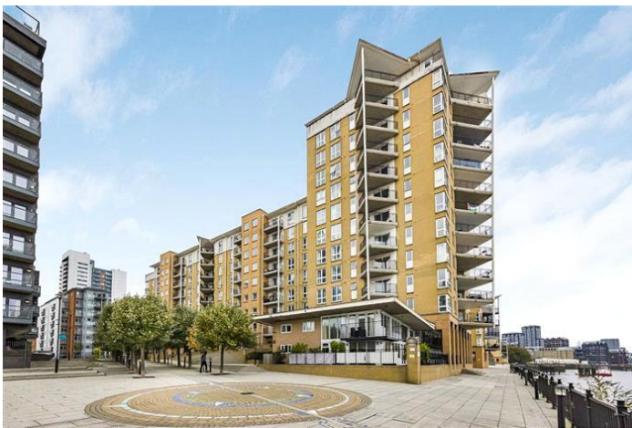
STUDLEY COURT, CANARY WHARF, E14 £1,900 PCM