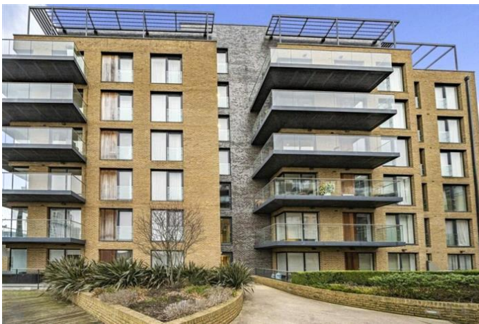
WALLACE COURT, BLACKHEATH, SE3 £1,750 PCM