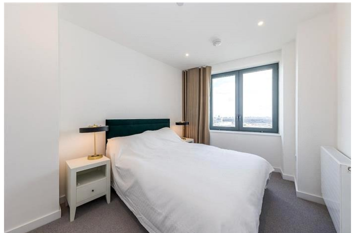
SKYLINE APARTMENTS, BOW, E3 £510,000 Leasehold