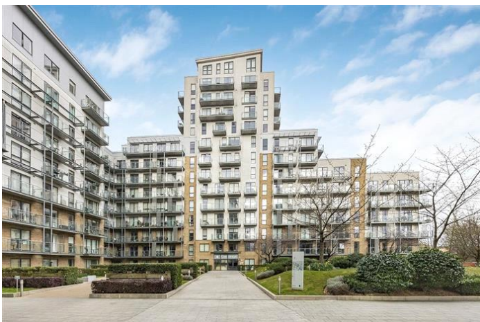
CERAM COURT, BOW, E3 £1,880 PCM